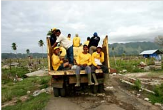
USAID workers cleaning up after the tsunami in Banda Aceh, Indonesia, in 2005.